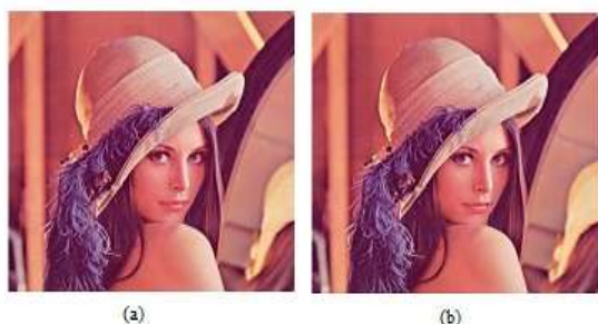
Figure 1 Original and Watermarked Image (Leena)

In this research paper, a new approach has been proposed. The blocks for embedding are selected using luminance of the image. The watermark is embedded using block pixel value differencing LSB substitution, which is more effective than direct LSB substitution. This approach achieves high imperceptibility and robustness of the embedded watermark. Only the blocks with log-average luminance close to the log-average luminance of the entire image are used to embed the watermark. The test results show that these blocks do not degrade the image when the pixels' luminance value is increased or decreased. Also, these blocks are less affected when various filters are applied to the image. The method is tested on various images and the results prove that the method is more effective and robust than previous method.