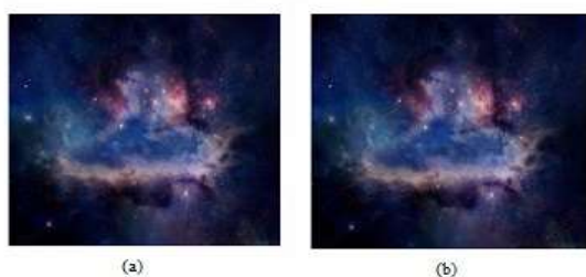
Figure 3 Original and Watermarked Image (Space)